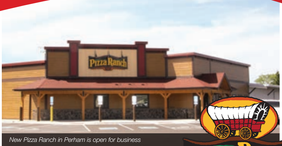
New Pizza Ranch in Perham is open for business