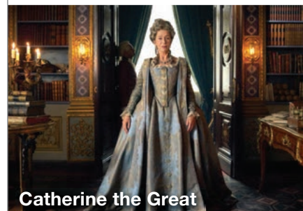
Catherine the Great