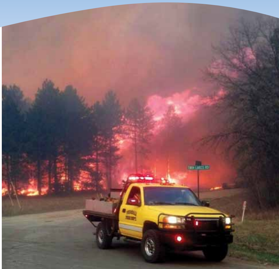
First responder unit on the Twin Lakes road.